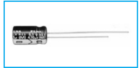
Marking color : White print on a blue sleeve or White print on an indigo blue sleeve